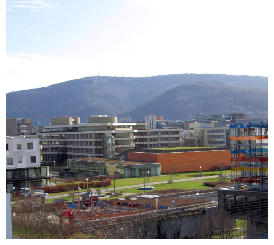
Fig. 1. The HIT building with the cupreous front embedded in the Heidelberg hospital ring (left: National Centre for tumor diseases (NCT); Head Clinics and Medical Hospital in the background; right: Children's Clinics).

the accelerator was developed [6]. From 1993 a pilot project at GSI was setup using this technology for treating around 450 patients with carbon beam from 1997–2008 [7, 8].