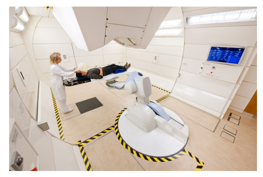
Fig. 4. Patient positioning procedure at the HIT gantry treatment place — for rotation of the gantry the closed folding ground floor is bent down.

necessary every two to six months. The stability is mainly influenced by stable temperatures of ambient air and cooling water.