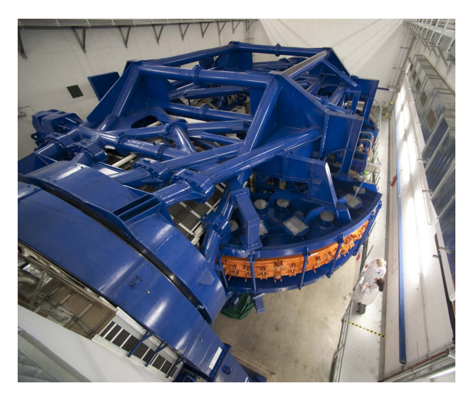
Fig. 3. The HIT 360^{\circ} ion beam gantry.